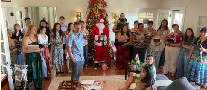
The Chamber Singers for the University of Hawai'i, Mānoa charmed staff and families with Christmas carols and an impromptu rendition of "Happy Birthday" for a house guest who had just turned one years old.

This past October, the House had a visit from Ronald himself! He also brought breakfast from McDonald's. We love being able to have fun days like this for the keiki and 'ohana at the House.