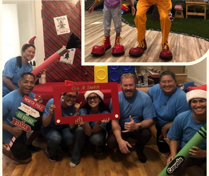
Volunteers from Marriott's Ko Olina Beach Club helped design and decorate a Toy Story themed "Santa's Workshop" with a collection of donated items (toys, clothing, accessories, etc.) Families were able to shop and wrap presents, free of charge.

Our annual Christmas Party was so much fun! We love celebrating the holiday season with friends and family here at the House!