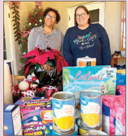
The kind folks from the Kiwanis Club of Honolulu donated household supplies, canned goods, gift cards, and a monetary donation.