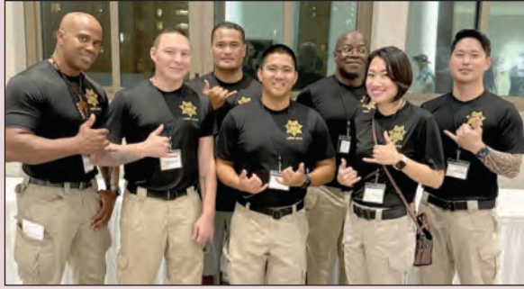
Our sincere thanks to the Department of Public Safety Sheriffs Recruit Class for their incredible support of our Gala set up and break down, as well as holiday decoration prep!