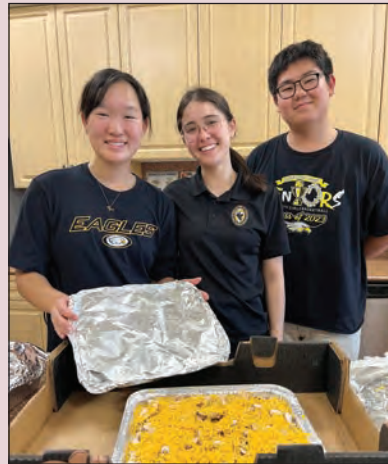
We were blessed with a pre-Thanksgiving meal prepared by student volunteers at Hawaii Baptist Academy .