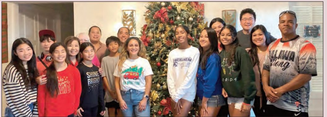
We are so grateful to the students and teachers at Kaiser High School for keeping our families happy and full with a wonderful Sunday dinner.