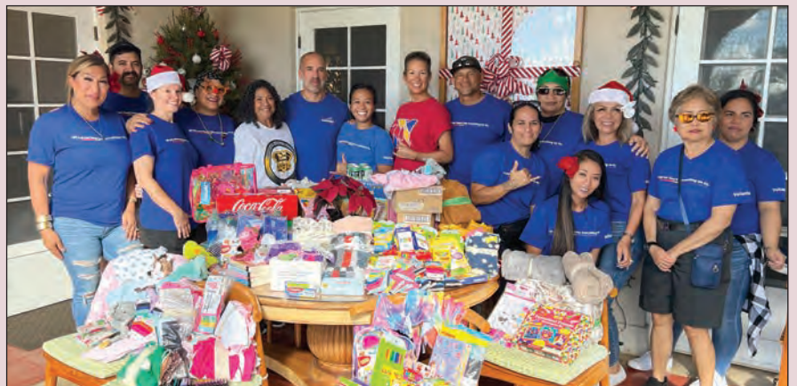
Our big-hearted friends at Southwest Airlines donated toys, blankets, meals, and even housecleaning!