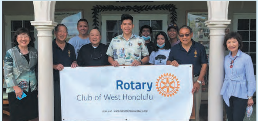
West Honolulu Rotary Club brought our families a dinner of rice, fish, garlic shrimp, corn, salad, hamburger steak with gravy.