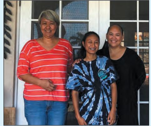
Ark Christian Center prepared a lunch of bbq ribs, potato salad, cole slaw, rice and dessert.