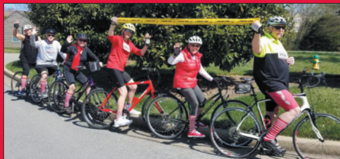
Callahan Crew showing their stripes from TN.