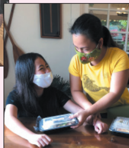
"We are so thankful that someone really cares, especially for us families who are away from home."