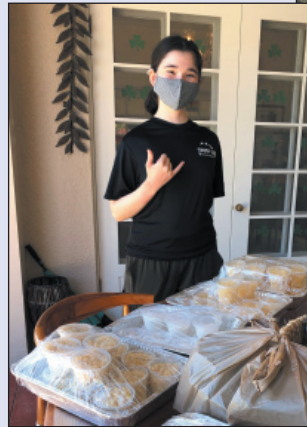
Girl Scout Troop 11