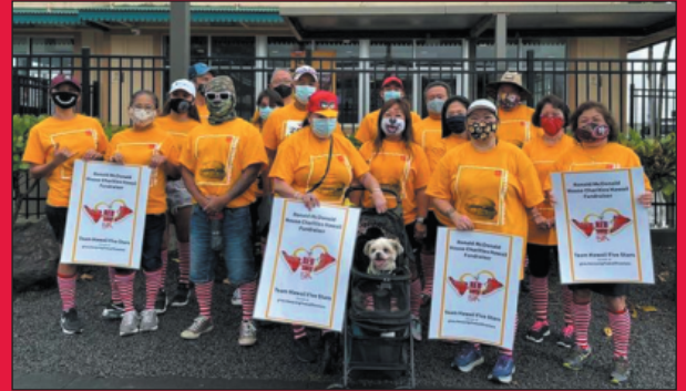
Most Spirited – The Hawaii Five Star Team came out in full force doing a parade in Hilo & Kona.