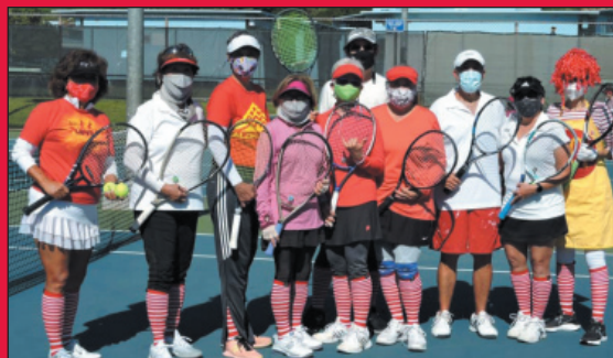
ELA & Friends created a "FUN"raising Tennis Tournament.