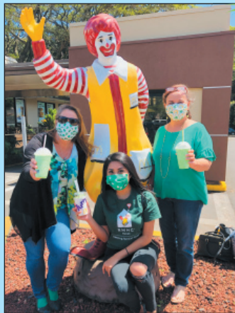
House staff stopped by Manoa McDonald's to get Shamrock Shakes to celebrate Saint Patrick's Day!