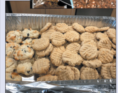
Iolani School Key Club