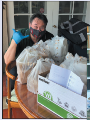
First Insurance Company of Hawaii