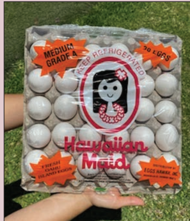
Hawaiian Made Eggs (Ka Lei Island Fresh Eggs) delivers dozens of eggs to our House each week.