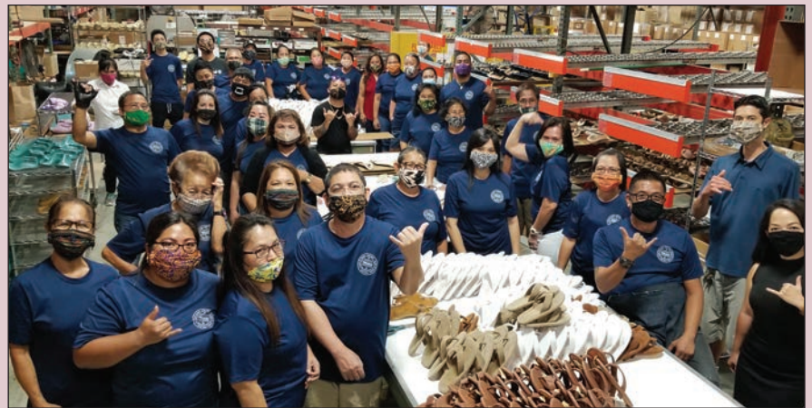
Island Slipper Factory donated masks for keiki staying at our House.