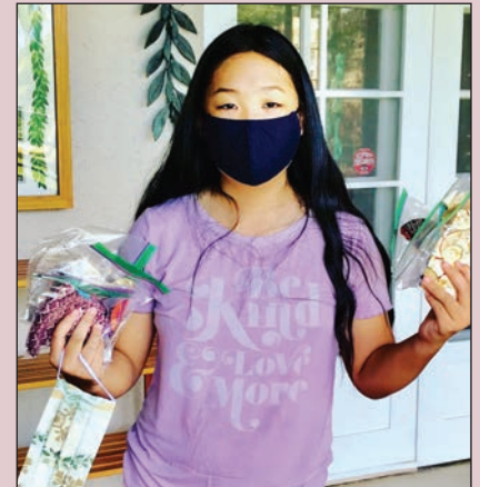
Honpa Hongwanji Girl Scout Junior Troop made us positivity boxes and face masks.