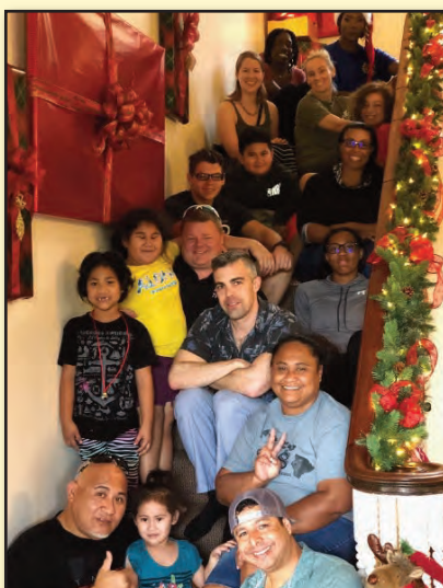
House guests enjoyed Sunday lunch served by the Serving Sabers.