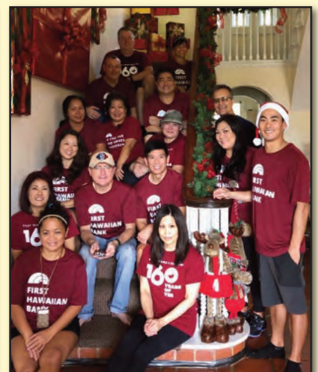
Meet our Sunday deep clean team from First Hawaiian Bank.