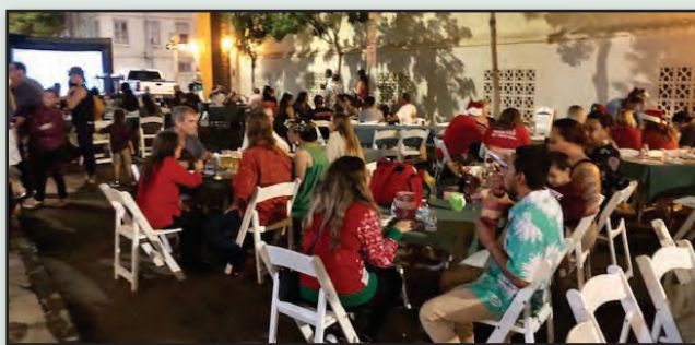
Miracle on Merchant Street Celebration.