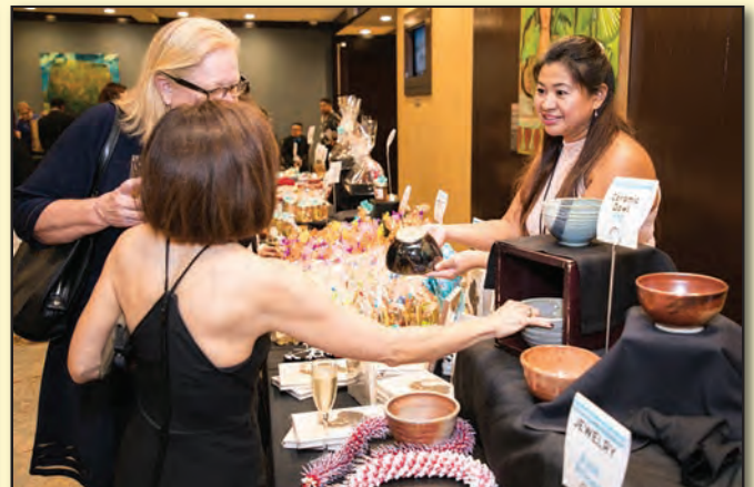
With the help of more than 100 volunteers our Share-A-Night Gala was a fun filled and successful night!