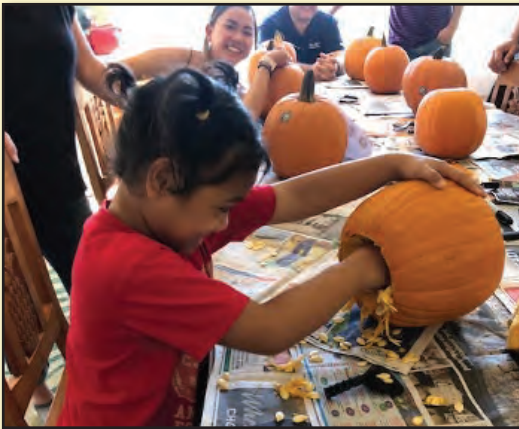
House guests enjoyed festivities and pumpkins provided by RAI Trade Marketing Services last October.

A big Mahalo to our wonderful volunteers. Your extra hands and support make Ronald McDonald House a "Home Away from Home."