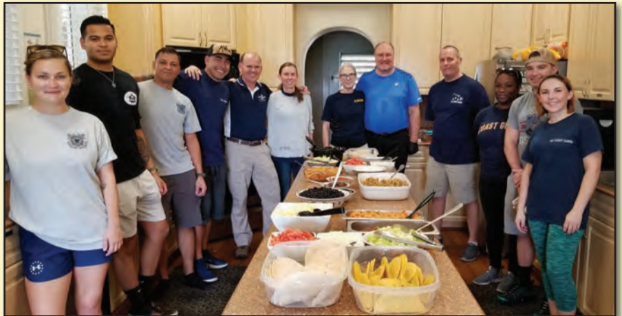
Coast Guard District 14 service men and women threw a taco party.