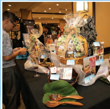
Guests view and bid on the multitude of silent auction items.