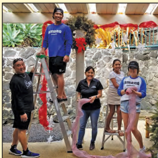
Amano Construction hosted dinner and took down Christmas decorations.