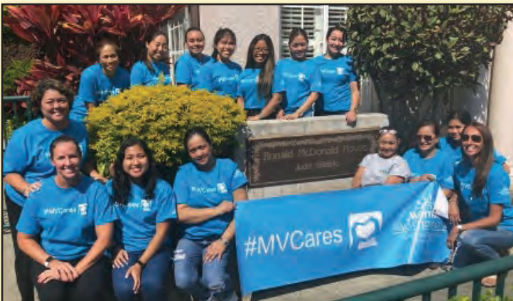
Marriott's Ko Olina Beach Club team hosted a pasta extravaganza.