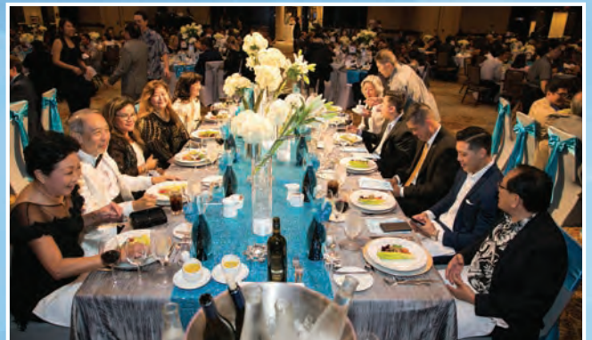
Our friends from McDonald's and all our guests ready to enjoy their meal and fellowship.