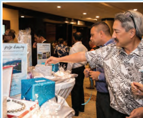
Guest decide which fabulous lucky drawing to drop their tickets in with the top prize being the Polaris Star of Hope diamond necklace from Hildgund Jewelers.