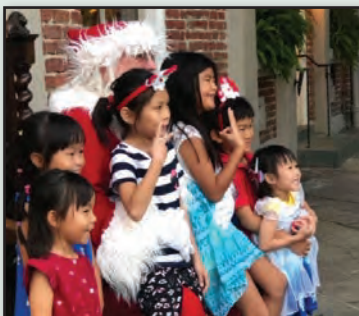
Children delight in holiday gift arrivals.