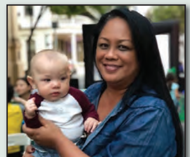
Waiting for Santa.