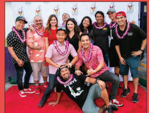
Red Shoe Mixer event partners