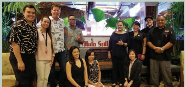
Hula Grill Team Ohana

Thank you, Hula Grill Ohana, for bringing our families together with your taste of Aloha! It is through longstanding community partnerships that we are able to make our House a "home-away-from-home" for our families. Mahalo from our RMHC Ohana!