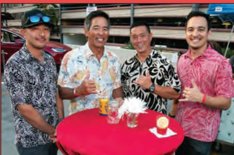
Red Shoe Mixer attendees enjoying cocktails and food.