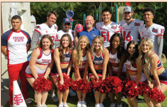
Fresno State's football team, cheer and dance squads visited the Judd Hillside Ronald McDonald House on December 23, the day before their big game against Houston in the Hawaii Bowl! And Fresno State won!