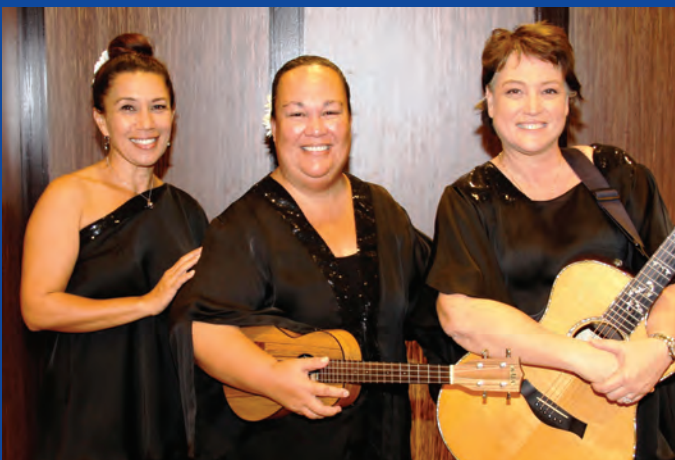
Na Leo Pilimehana