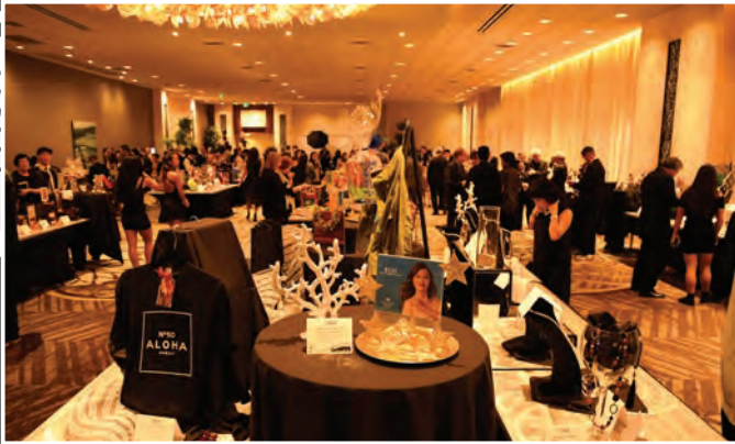
Cocktails and great silent auction items tempt guests into bidding