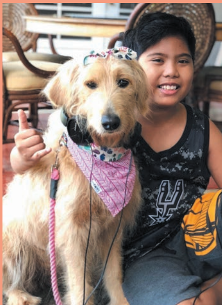
Kaia the Goldendoodle is becoming a regular visitor at the Ronald McDonald House. Everyone she meets falls in love with her.