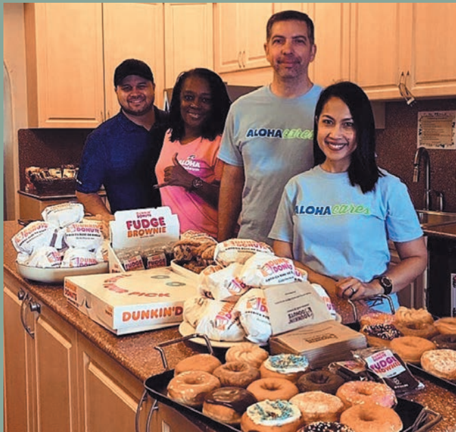
The kind folks from Aloha Petroleum and Dunkin' Donuts stopped by the Judd Hillside House on Saturday, August 4 to drop off breakfast for the families!