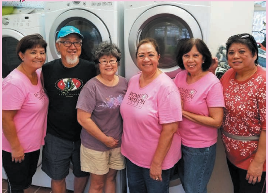
On August 4, six members of Moms On A Mission rolled up their sleeves to give the bathrooms at the Judd Hillside House a thorough, deep-cleaning. This dedicated group has lent incredible support for RMHC Hawaii for years now! They are truly among our special heroes.