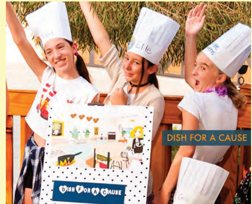
DISH FOR A CAUSE