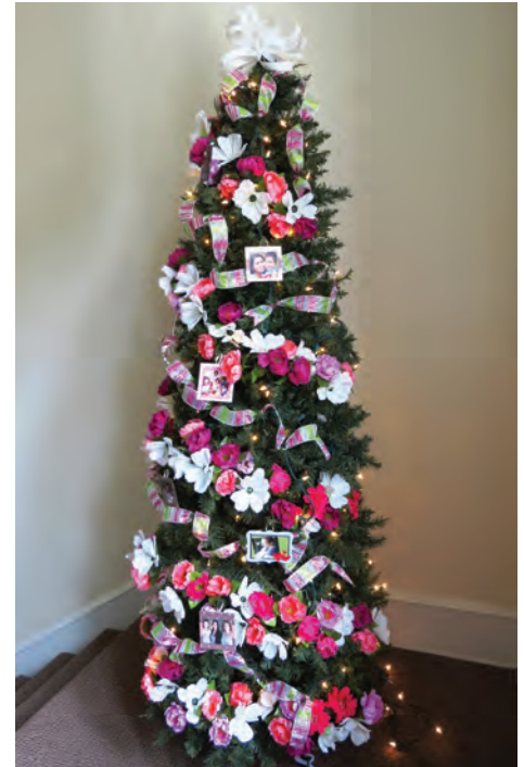
Our Family Tree, adorned for Mother's Day.

On your next visit to the House That Love Built, be sure to take a minute and write a message of support, offer words of encouragement, or maybe even share a heartfelt holiday wish at our perpetual tree, the RMHC Family Tree.