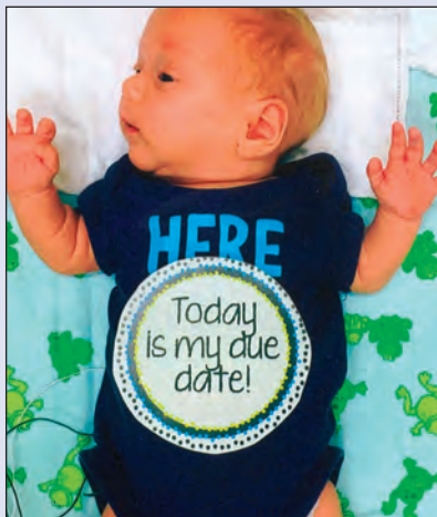
Kai early, but raring to go!