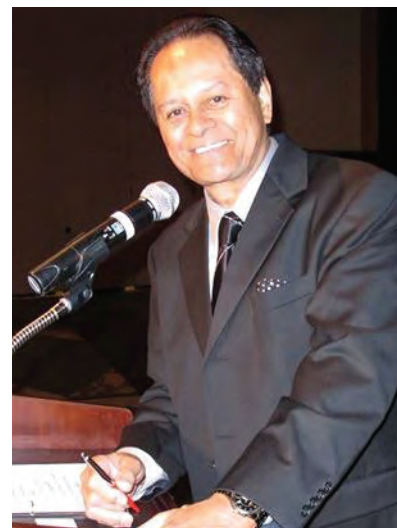
Al, doing what he likes best - working with a live audience.