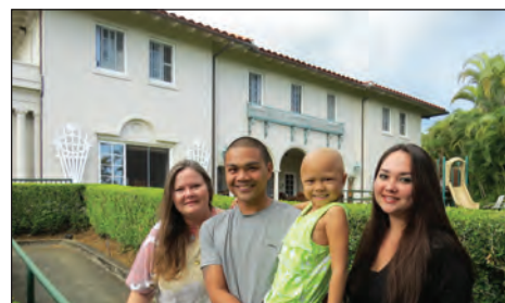
The Judd Hillside House, as it looks today, a home-away-from-home.

Another great chance for you to reconnect with Ronald McDonald House is by joining us at our 30th Anniversary Mahalo events on all the islands. Each event will be extraordinary, with Ronald McDonald performing his show and reaching out to the community, and musical entertainment, prizes, and fun activities for everyone. On Oahu, our first Anniversary event will be at the Kahala Mall Center Stage on March 27 (Kuhio Day) from 11 a.m. – 2 p.m. That is RMHC-Hawaii's actual 30th birthday!