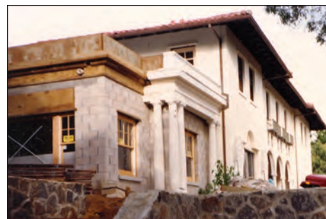
The Judd Hillside Ronald McDonald House, circa 1987, preparing for families.