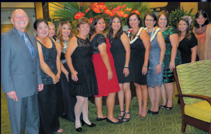
The RMHC-HI staff was decked out for the annual Gala, and the ballroom at the Waikiki Sheraton Hotel was filled with enthusiastic supporters.