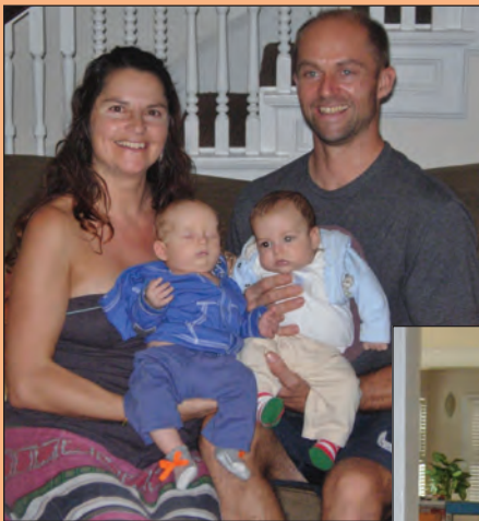
Growing fast! The Flaherty family.