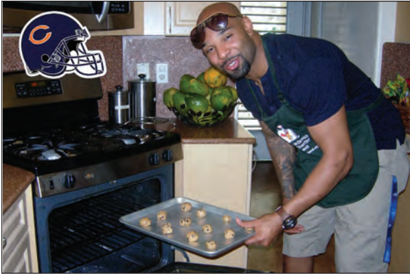
Matt Forte, Chicago Bears running back at the Judd Hillside Ronald McDonald House on January 23.

The N.F.L. Pro Bowl game will be sorely missed if it doesn't continue to take place in Hawaii. In addition to the millions of dollars it brings the state's economy, each year the game generates significant donations for Hawaii non-profits. These grants are not the only way the Pro Bowl contributes to the community, either. Many of the players have a genuine enthusiasm for giving of their time when they are here to meet and encourage young people.