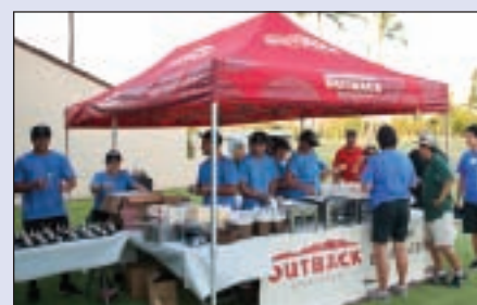
Thank you Outback Steakhouse-Waipio for the great feast!