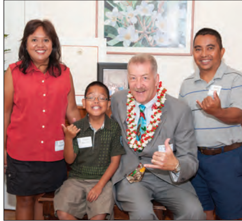
Honolulu Mayor Peter Carlisle with the Saligumbas