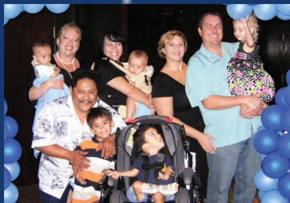
Some of the RMHC-HI families in attendance posed together at the entrance to the ballroom.