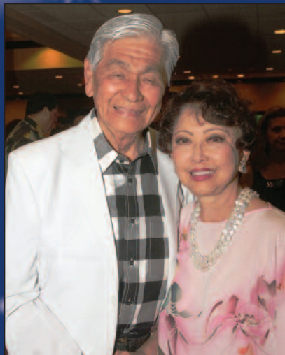
George and Jean Ariyoshi