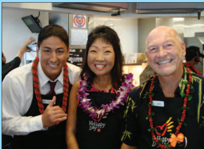
McHappy Day—November 19, 2010

These reliable news and information sources are all extremely committed to supporting the communities that they serve. RMHC-HI is honored to be teaming up with them to assist families in those communities!