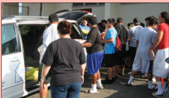
The boys at the camp not only brought the donations, they even loaded up the RMHC-HI van themselves.

Brian Derby has been conducting annual camps for offensive linemen for 15 years and they are free for anyone that brings food donations for RMHC-HI. "We suggest that they bring a ten pound bag of rice and some canned goods," says Brian. "But many of them went way beyond that."