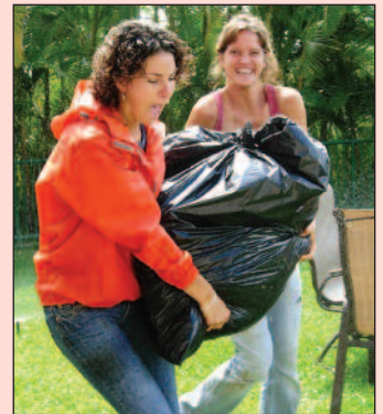
Volunteering is fun.

Help around the House with all the "extras" that need to be done.