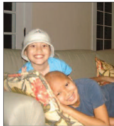
Kids undergoing treatment get to go on being kids while they're staying at the Ronald McDonald House.