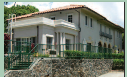
Ronald McDonald House - Judd Hillside