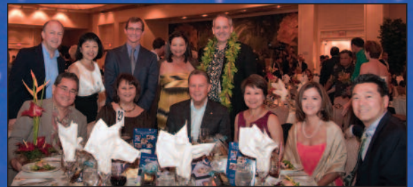
Outrigger Ohana Members