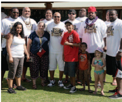
RMHC-HI Families posed with the NFL players at Wet 'n' Wild Hawaii.

On President's Day, our friends out at Wet 'n' Wild Hawaii hosted