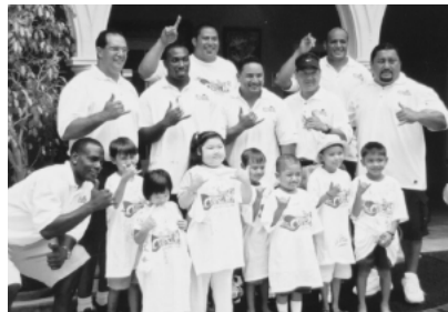
The NFL contingent poses with the RMH kids before heading off to Samoa.