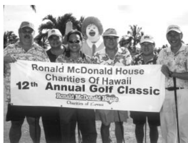
Meadow Gold & Matson teams