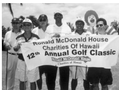
First Insurance & MAXECASH teams