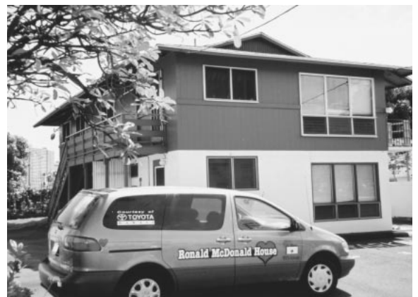
Ronald McDonald House at Dole Street