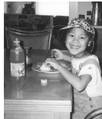
"Mom cooks and I eat. We're a perfect team!"