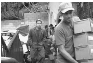
Otis Elevator employees arrive ready to make a difference.