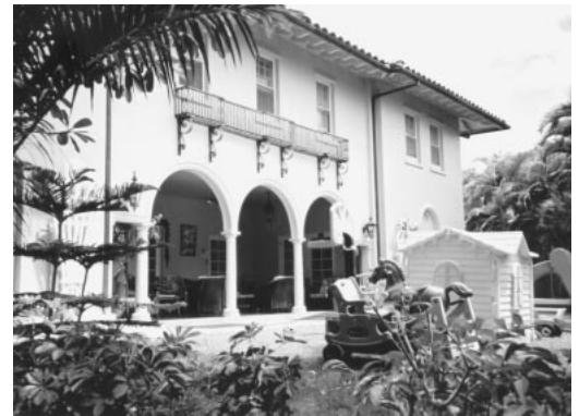
Ronald McDonald House at Judd Hillside

Taking care of families and their lodging needs during a very critical time is what our cornerstone Ronald McDonald House program is all about. For more than 16 years we have had 10 bedrooms at the Judd Hillside House to offer our families. We have also had the luxury of offering Outrigger Ohana Hotel rooms for families with short stays or during overflow House situations. Now, with the addition of the Dole St. House and its eight guest rooms, we are fortunate enough to be able to provide three distinctly different types of housing options for families. Placement of families to the appropriate location is critical for our operational success as well as for the comfort of our guests.