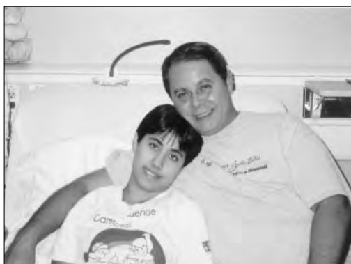
Getting a reassuring hug from dad who would soon sport a new look for her.