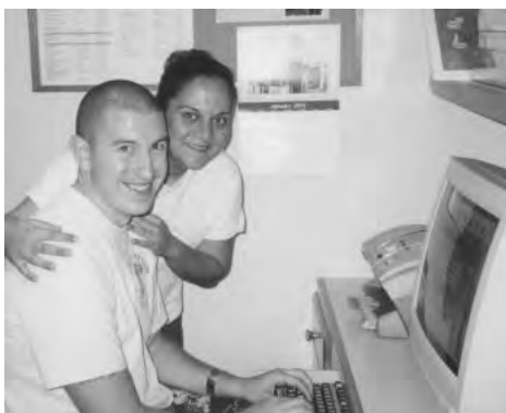
The Reeves use the computer to check their E-mail.