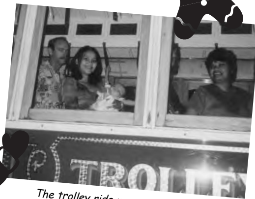
The trolley ride was enjoyed by all.