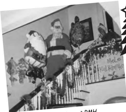
Santa arrives at RMH.