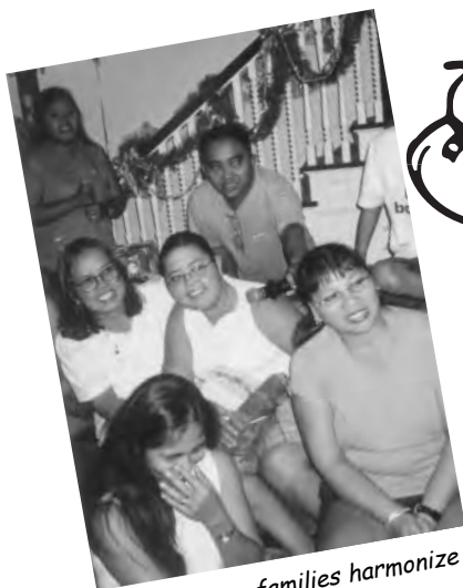
Manoa House families harmonize during karaoke contest.

In the months to follow, families will continue to find hope and the gift of friendship and compassion in many small doses, day after day at the Ronald McDonald House. One anonymous poet wrote: "In the dew of little things, the heart finds its morning, and is refreshed".