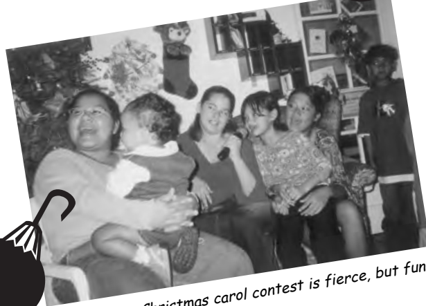
The karaoke Christmas carol contest is fierce, but fun.