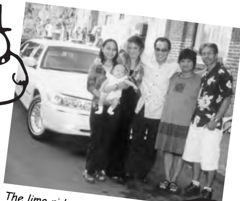
The limo ride to Murphy's made families feel special.