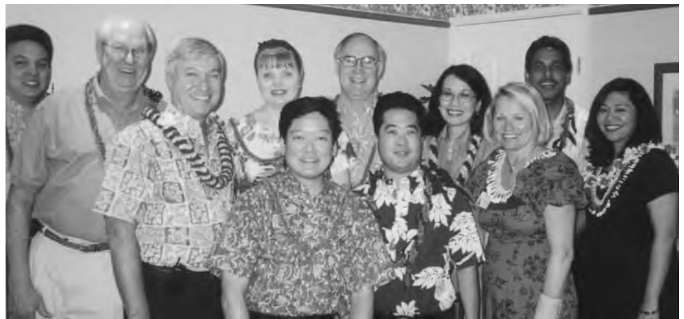
RMH Family Room supporters, RMHC & KMCWC reps. and the Lt. Governor are all smiles.