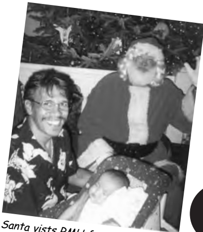
Santa visits RMH families at Murphy's.