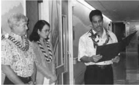
Lt. Governor "Duke" Aiona reads proclamation.